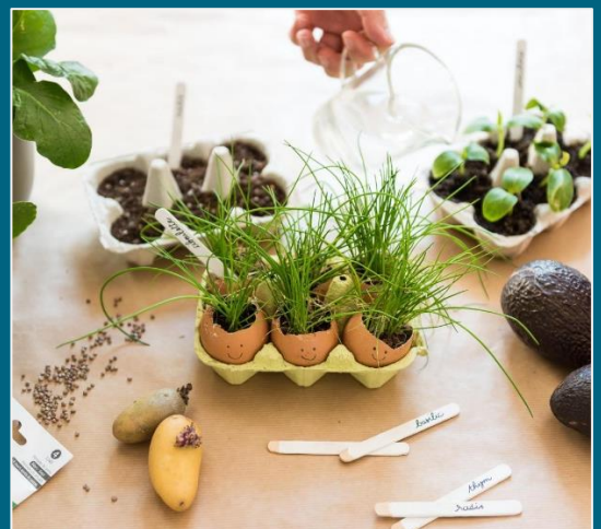
Image & Activity Source: klorane.com/au-en/content/tips-eco-friendly-school-holiday-activities

Choose fast-growing seeds. Radishes, fava beans, dried beans, lentils and chickpeas, etc. are all ideal for planting with children, because their journey from seed to shoot to plant is fast and they require little care - just a little water and you'll be seeing progress every day. Some flowers, such as nasturtiums and marigolds, grow quickly and can be used to decorate salads or desserts.